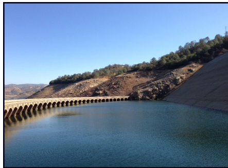
The original Exchequer Dam, above, was constructed in the 1920s. It has mostly remained submerged after the larger New Exchequer Dam was constructed just downstream in the 1960s. The original dam is visible, at left, in the shadow of the larger New Exchequer Dam after two dry years.

in the 1960s, MID entered into a significant agreement with Pacific Gas and Electric Co. The private utility agreed to a 50-year arrangement in which PG&E received the benefit of the energy produced at the Project. In turn, MID was able to construct and operate the new dam and powerhouse with no cost to the District.