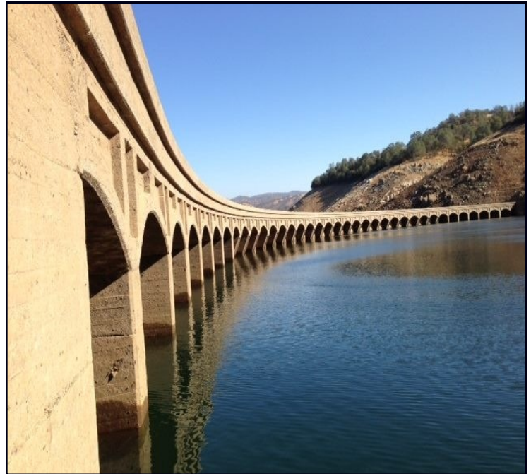
The original Exchequer Dam continues to emerge from Lake McClure as the water level drops in a second dry year. This is the top of the original 1920s dam as seen in early November.

As MID enters the winter months, Lake McClure is holding less than a quarter of its water capacity. This is the result of two consecutive dry years. In fact, the water is so low that the original Exchequer Dam – normally underwater – became visible in October. The original dam was built in the 1920s and has generally remains submerged since the larger New Exchequer Dam was constructed in the 1960s. It was last seen in 2008.